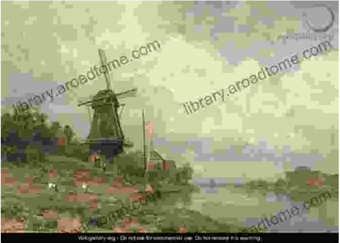
Gerardina Van De Sande Bakhuyzen, Landscape with a Windmill (1650)