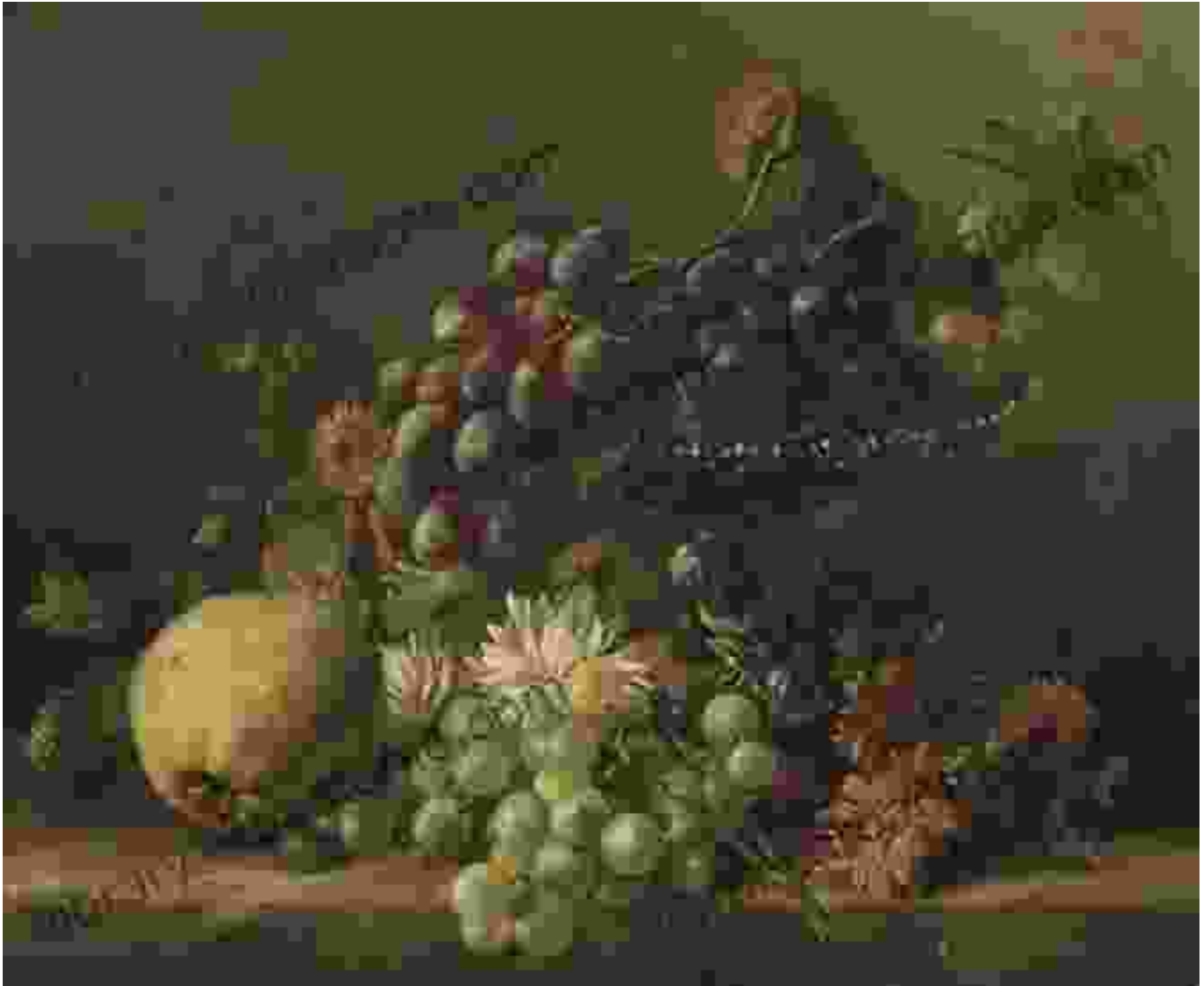
Gerardina Van De Sande Bakhuyzen, The Laundress (1661)

Bakhuyzen also excelled in landscape painting, capturing the beauty of the Dutch countryside. Her landscapes often featured serene rivers, rolling hills, and picturesque villages. Her painting " Landscape with a Windmill " (1650) exemplifies her ability to capture the grandeur of the natural world, with its expansive sky, towering windmill, and meandering river.