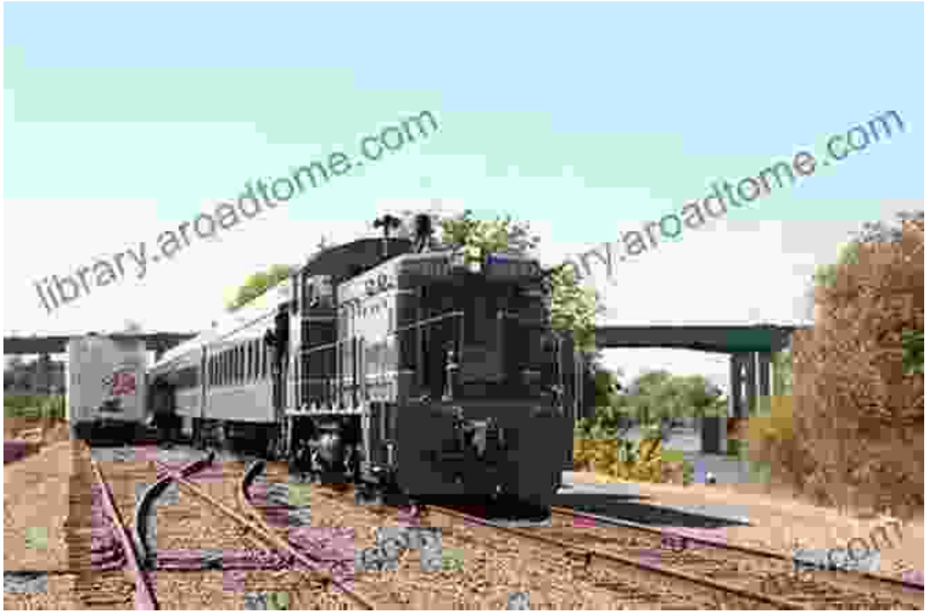
A Sacramento Southern Railroad train passing through a field of wildflowers in the Sacramento Valley in the 1950s.