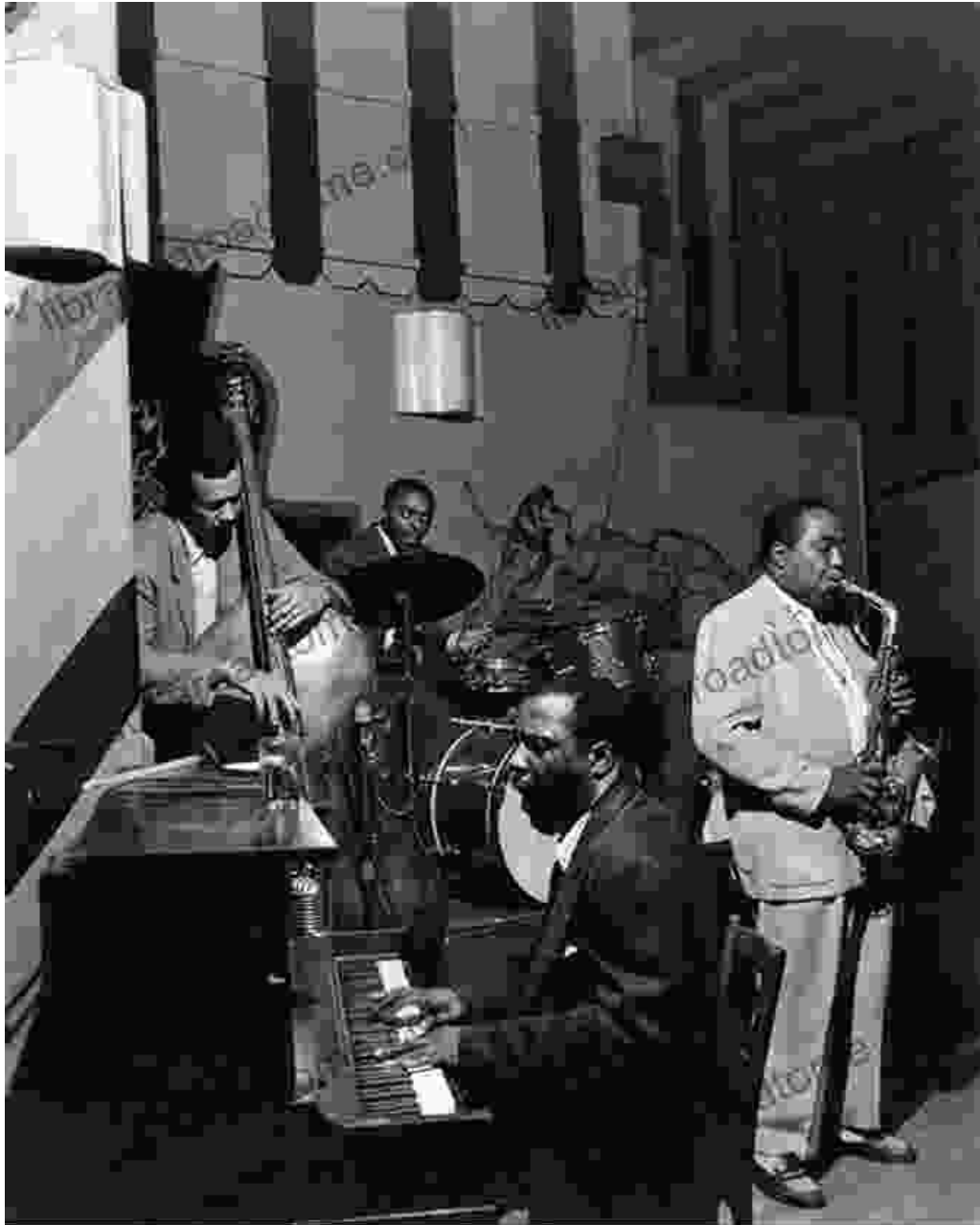
A jazz band performing at a nightclub in the 1950s.